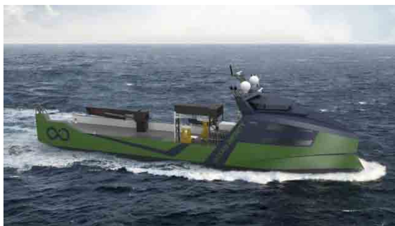
Marine robotic vessels, remotely controlled and prepared for green fuels, By The Maritime Executive 11-23-2020 02:58:30