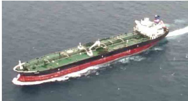
Godam sailing off the coast of Australia - 12-03-2020 09:21:45

In a stroke of good luck, a Marshall Island flagged crude oil tanker, the 113,553 DWT Godam , happened upon two people floating in the Torres Strait separating northern Australia and Papua New Guinea this morning. A coastal pilot aboard to assist with the navigation of the tanker, sighted the two individuals clinging to a timber of wood in the ocean.