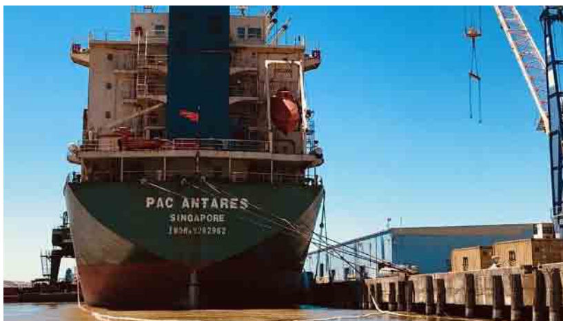
Pac Antares during her 2018 oil spill in New Orleans -, By The Maritime Executive 12-02-2020 05:40:54

In the latest example of a shipowner and its crew knowingly concealing the discharge of oily water, Pacific Carriers Limited, based in Singapore, pleaded guilty in U.S. District Court in North