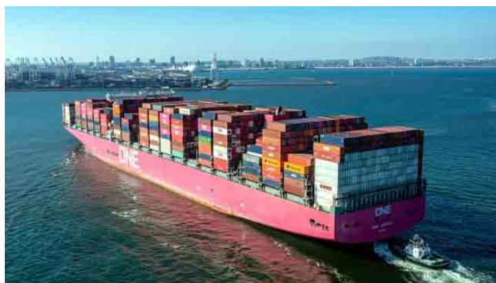
One Aquila during her maiden arrival in California in April 2020 - 11-06-2020 05:20:53